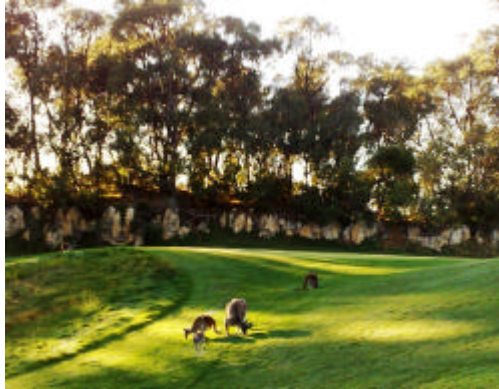
Kangaroos op Joondalup

Hier by ons. In Australië, was daar ook 'n verandering van die voorgee-stelsel. Die mans voorgee was voorheen beperk tot 27, maar het verander na 'n voorgee tot 36. Die ander verandering wat eersdaags gaan plaasvind is die sg "course rating" sisteem. Huidig word die baansyfer (par) bepaal deur die lengte van die baan en daar is geen inagneming van moeilikheidsgraad nie. Sommige bane is redelik maklik om te speel omdat die ruveld baie skoon is en daar min beskerming van die setperke is deur sandputte of water, of selfs net elevasie veranderinge.